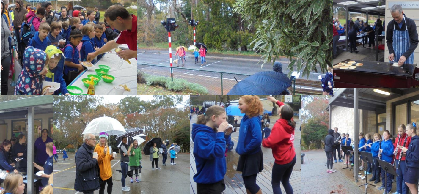
Walk to School Day 2017